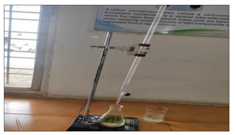
Figure No. 24:- Saponification value determination