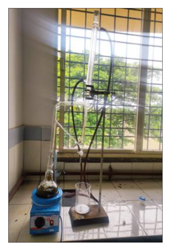
Figure No.13:-Clavenger assembly