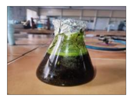
Figure No. 17:- Extracted oil