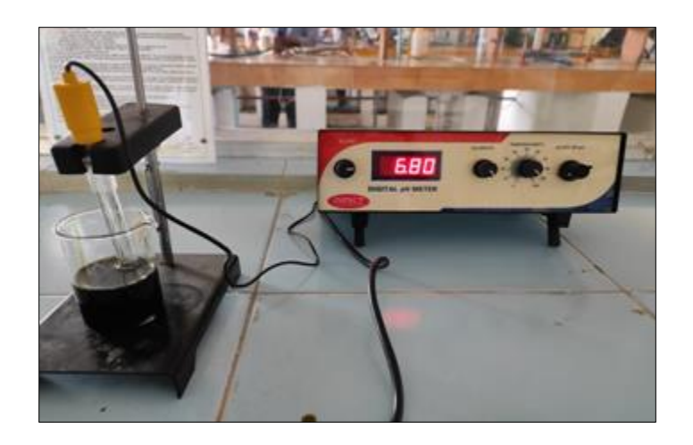
Figure No. 25:- pH meter reading