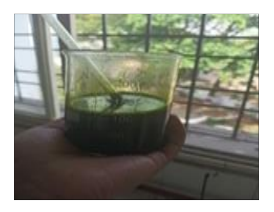
Figure No. 19:- Filtered oil