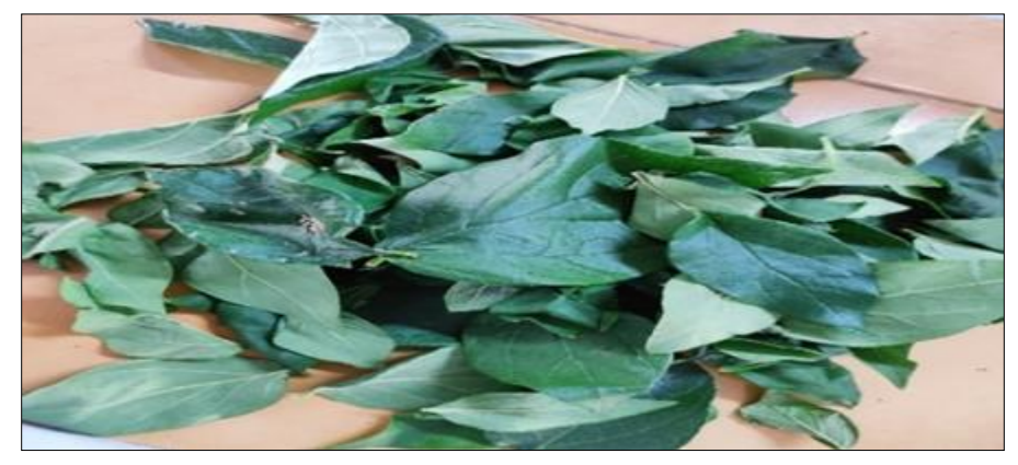
Figure No. 2:-Harsingar leaves