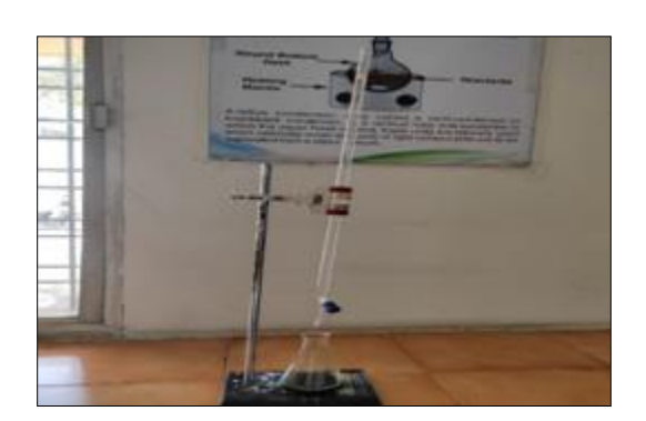
Figure No. 22:- Acid value determination