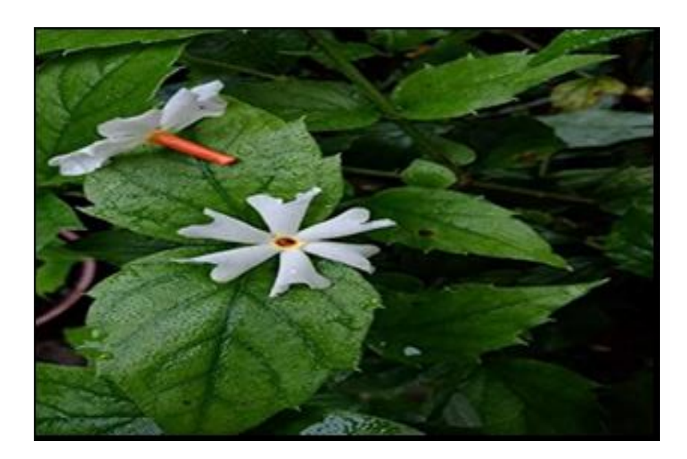
Figure No. 1: Nyctanthus arbor tristis

plenty of sunlight and it cannot survive in a frosty or cold area. It grows best in sandy sol, moist and well drained soil. It cannot grow in highly saline soil. It is usually found in some regions of South Asia and Asia. The botanical name of the Harshingar (Parijat) Oil is Nyctanthes arbor-tristis and extracted from the Leaves by the process of Steam Distillation method. The other names of Harshingar (Parijat) oil are Night-Flowering Jasmine, Parijat and Coral Jasmine. We use Amber Color Glass Bottle for storage <sup>[2][3]</sup>