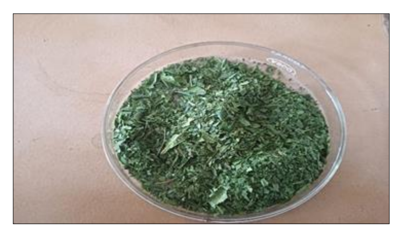
Figure No. 10:- Neem