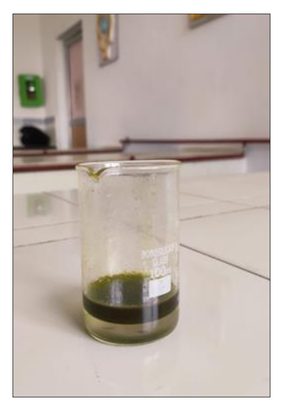
Figure No.14: Aqueous & oil extract