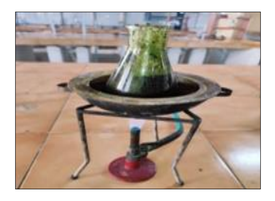
Figure No.16:- Heating on water bath