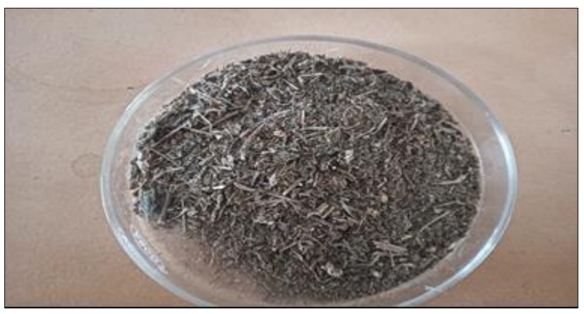
Figure No. 6: Brahmi