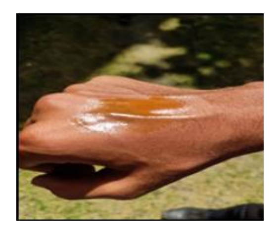
Figure No. 21:- Sensitivity test