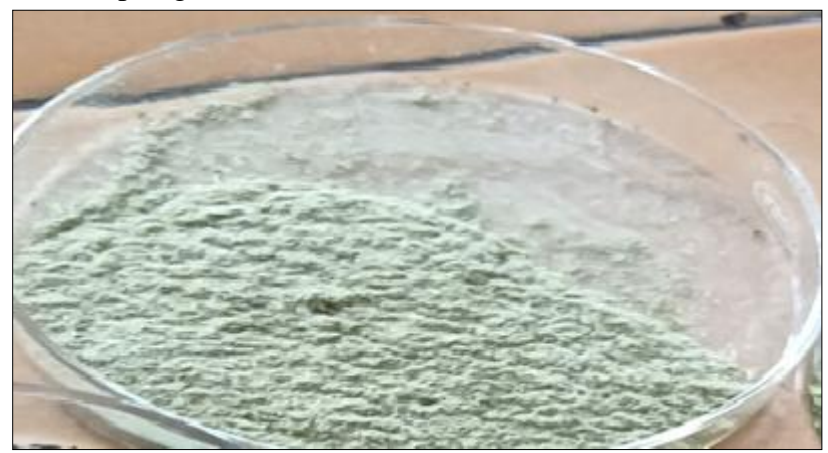
Figure No. 5:- Shankpuspi

Family: Liliaceae Chemical constituent: Shatavarin I to IV 0.2%, Sarsapojenin Uses: Nervine disorder <sup>[5].</sup>