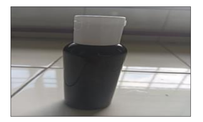
Figure No. 20:- Formulated oil