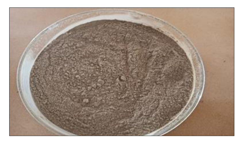
Figure No. 3: Amla Powder

Family: Euphorbiaceous Chemical Constituents: Vitamin C and Tannin, Calcium, Iron Uses: Hair growth activity <sup>[5].</sup>