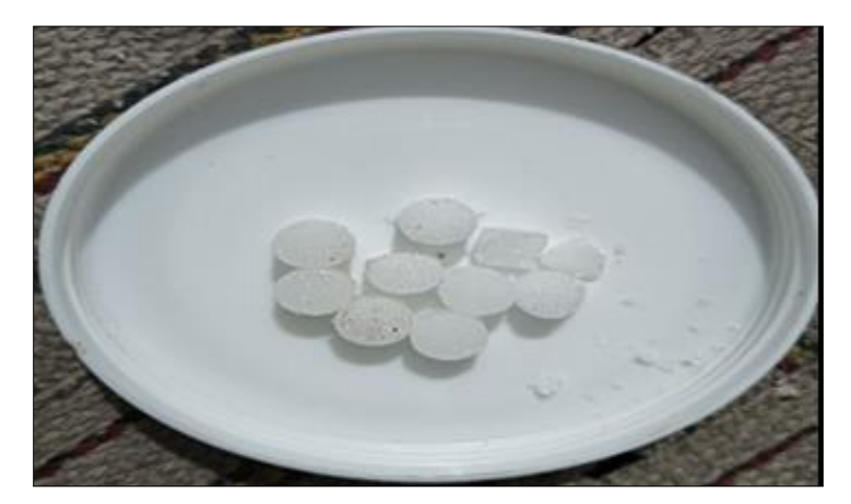
Figure No. 7:- Kapur

Uses: Pain relive and Reduce Itching <sup>[5]</sup>.